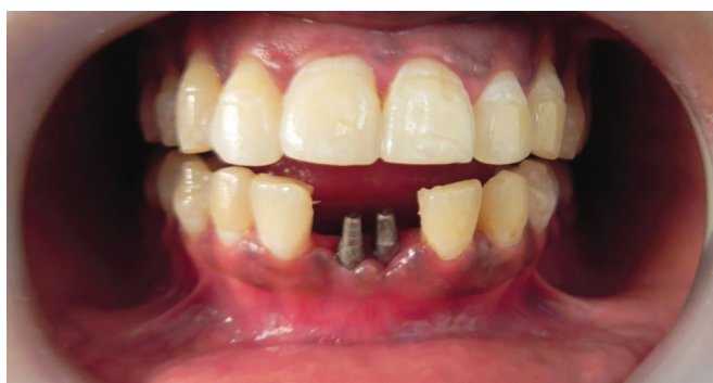
Fig. 1: One-piece implant in position

Immediate loading of dental implants is becoming a widespread therapeutic procedure for the rehabilitation of patients with edentulous jaws. A review by Prithviraj et al 10 on an OPI concluded that most of the surgeons preferred delayed placements with immediate loadings of OPIs. It was reported that the use of an undersized form drill, in combination with, a conical implant design, could lead to a higher initial stability than that, which was seen with conventional implants. 10 As far as the surgical protocol is considered, less patient discomfort (less pain, swelling, analgesic dose) was observed in flapless procedures than in surgeries with flap. Moreover, it took fewer appointments and less surgical time. Also, blood