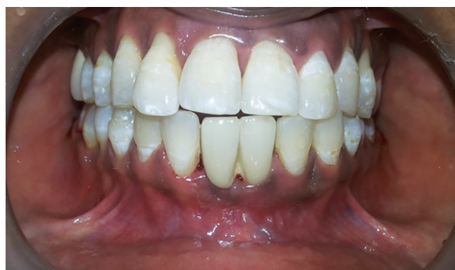
Fig. 4: Three years' follow-up