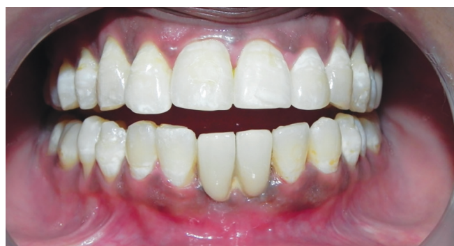
Fig. 2: Porcelain fused to metal crown in position