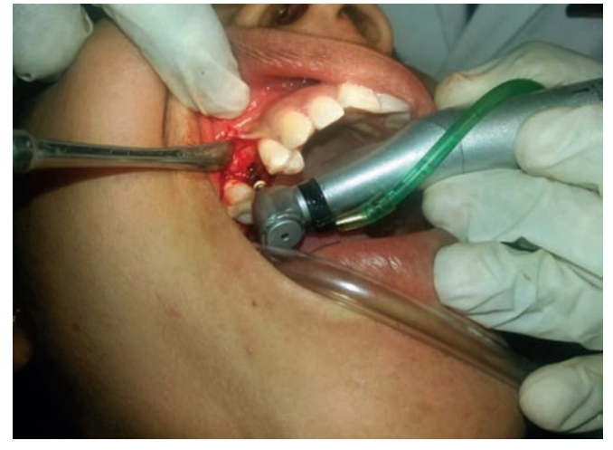
Fig. 4: Initial pilot drill