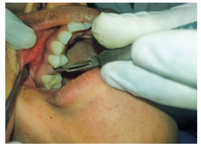
Fig. 2: Incision