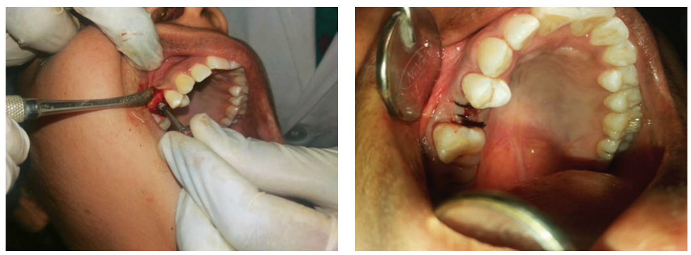
Fig. 6: Implant placement