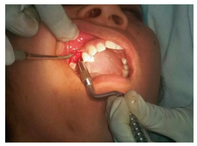
Fig. 5: Sinus lift instrumentation